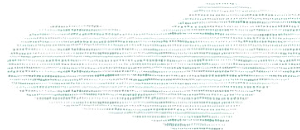
Figure 1: Step 1-3 Worksheet Sample